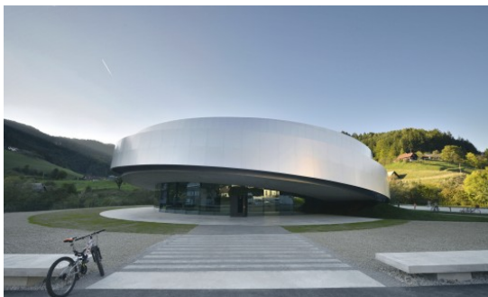
The Cultural Center of European Space Technologies (KSEVT)