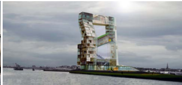
Landmark Tower/U2 Studio at Britain Quay