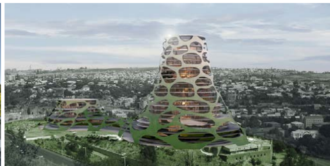
4 Seasons Tent Tower / Mercedes Benz Hotel Tower